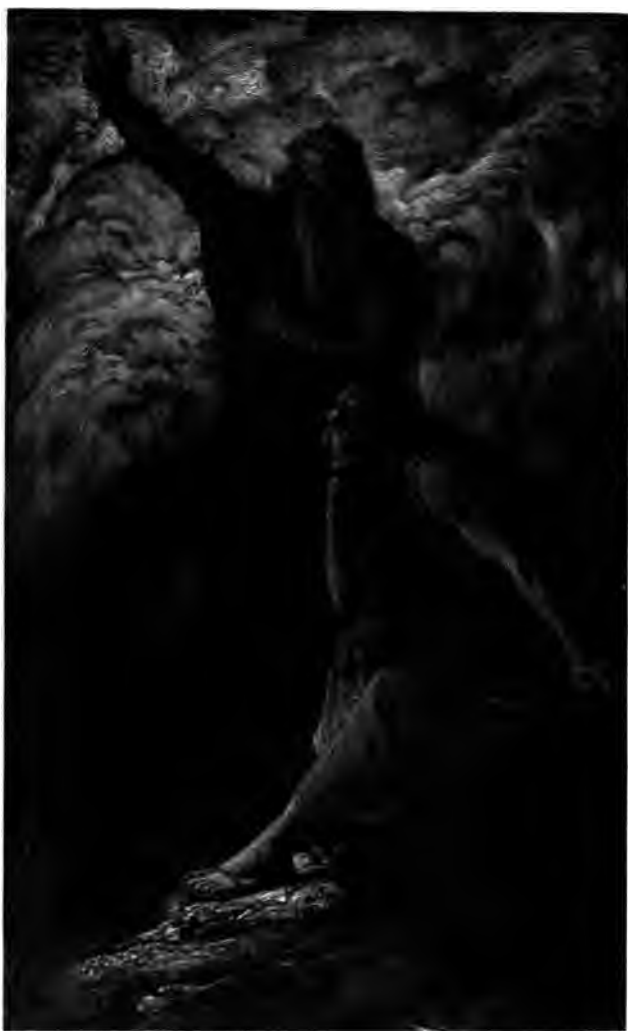
From a Painting by Sigismond de Ivanowski